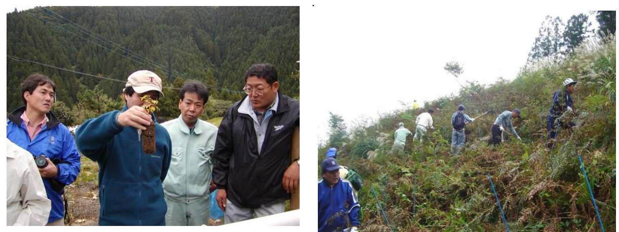
Grass mowing by volunteers

▼ Knowledge sharing between local people and experts