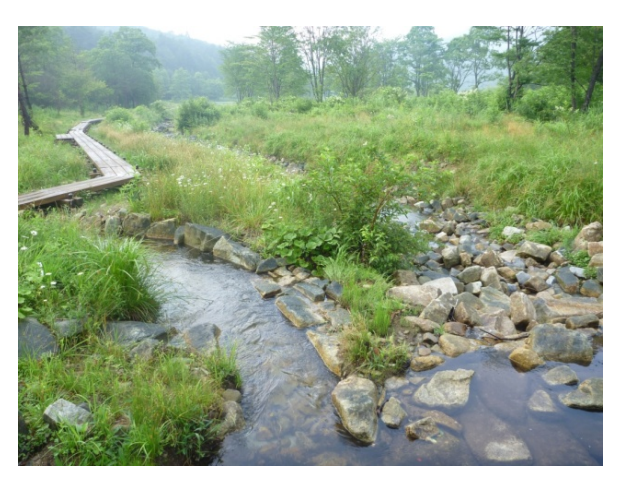
Channel improvement and installation of channels

RESULTS AND CHALLENGES Channel improvement, installation of channels and tree felling were conducted by the prefecture. As a result, the marsh is recovering and the spawning of salamanders and frogs, immigration of aquatic insects and flowering of aquatic plants have been observed. Establishing financial and organisational bases for ongoing monitoring, as well as a local community that can support tourism and education, is imperative.