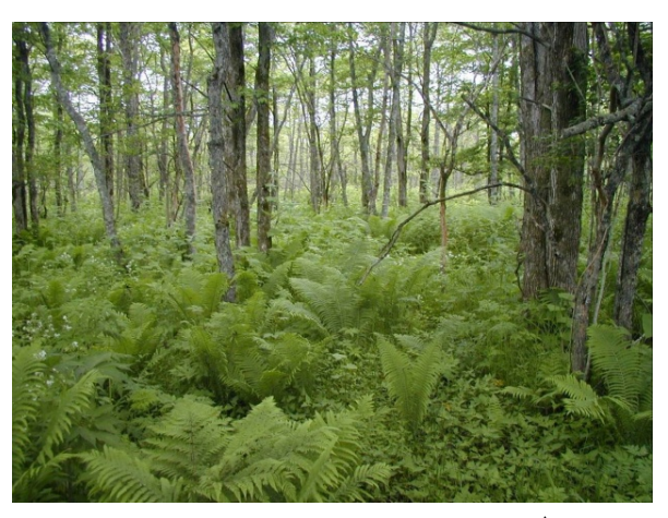
Alders have colonized into Kushiro marsh 🔺