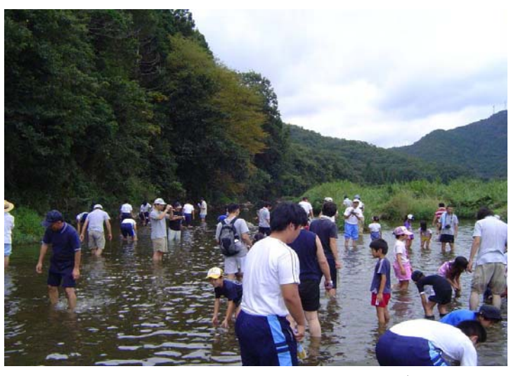
Many people participated in the restoration work.

GOAL The project to recover the red algae was initiated in 2002. Studies of the life cycle of the red algae revealed that disturbances such as flooding are essential to remove competitive algae from stones so that the target algae can