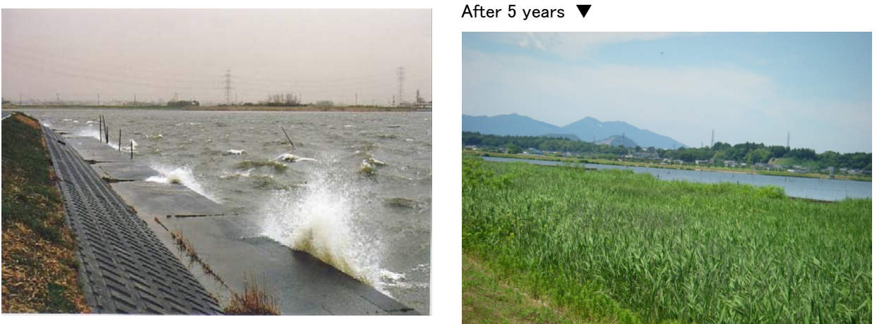
\blacktriangle Before the restoration