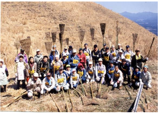
Volunteers for grassland management

GOAL Voluntary activities in support of grass burning were initiated in 1997, after which several other activities promoting grassland restoration were introduced. Eventually, the Commission for the Restoration of Aso-Grassland was established in December 2005.