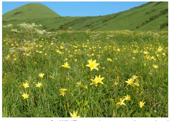
▲ Wildflowers in managed grassland